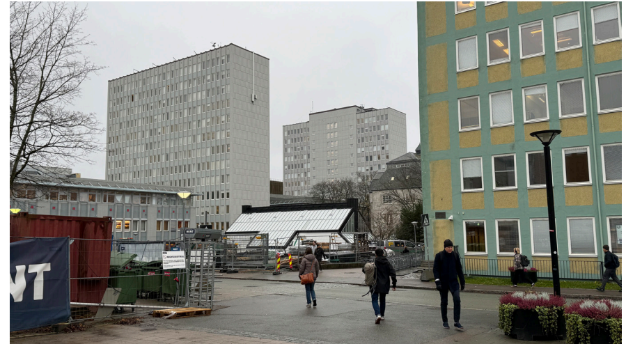
The high rise buildings seen from the bus stop Gløshaugen