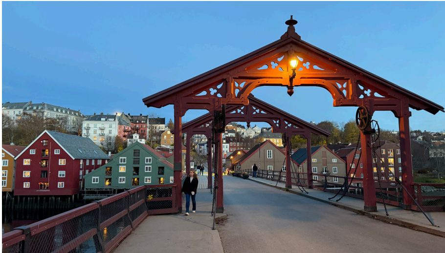
The Old City Bridge. The place for social gathering Thursday eveningn, “Den Gode Nabo” , is in the ochre yellow buidling seen in the middle of the gate