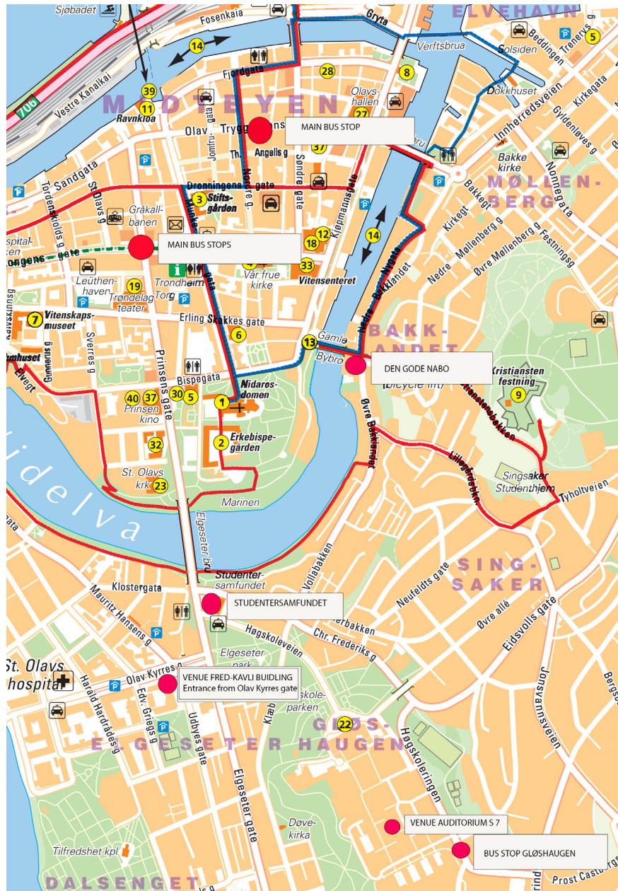
Map of the city and venue 1 & 2