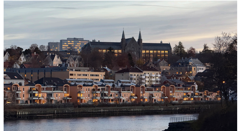
The main building of the university as seen from the Old City Bridge The venue 2, Auditorium S7 is close to the high rise building to the right