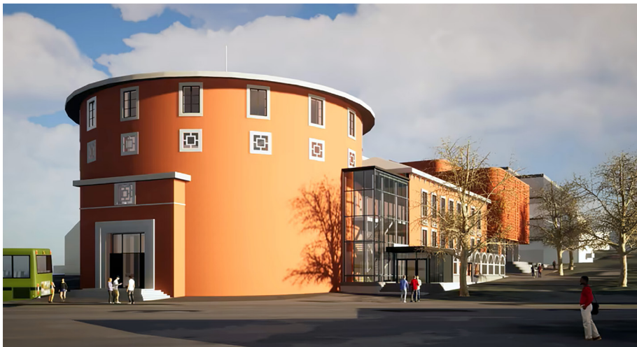
“Studentersamfundet i Trondheim”. The Students’ Society