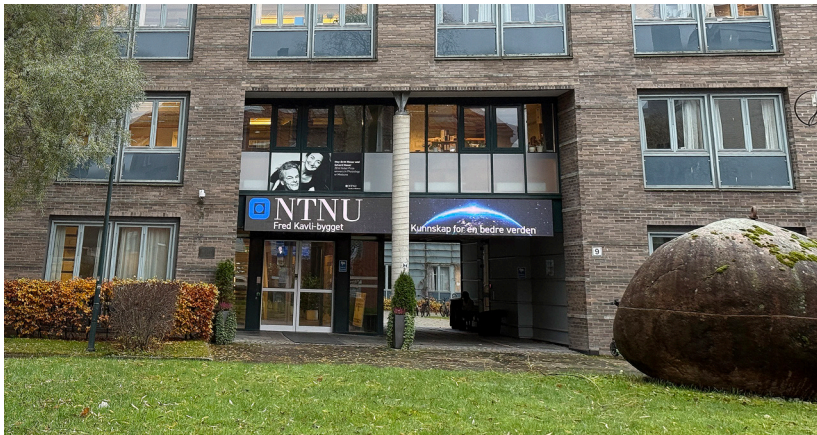
Venue 1 “Fred-Kavli-bygget”/Fred-Kavli-Building. Entrance to the left