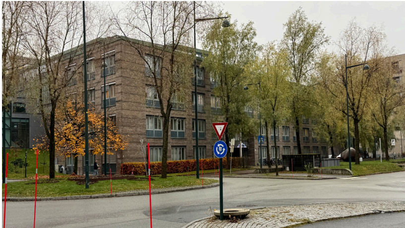
Venue 1 “Fred-Kavli-bygget”/Fred-Kavli-Building